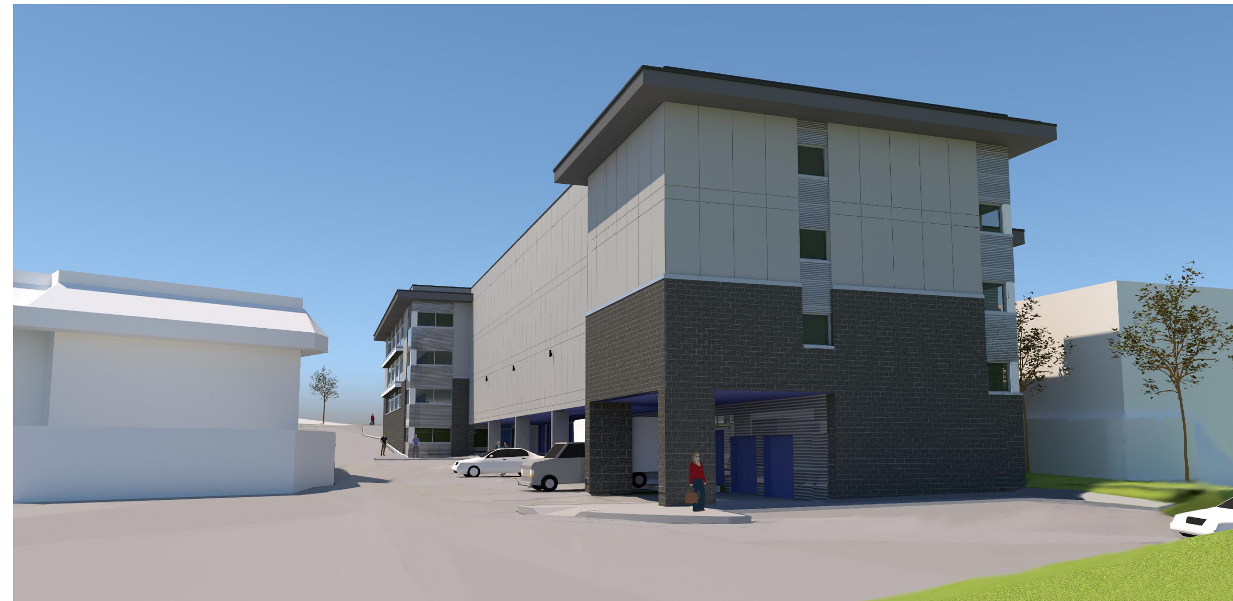
4 VIEW FROM NORTH-EAST