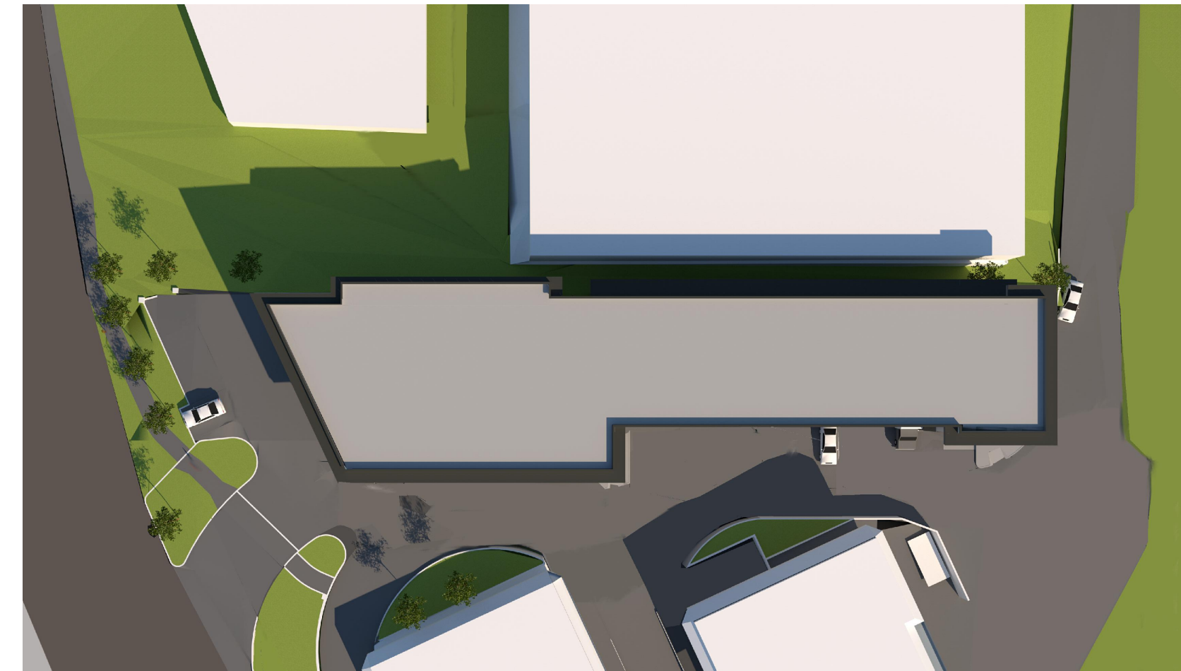
7 SEPTMEBR 21, @ 10am