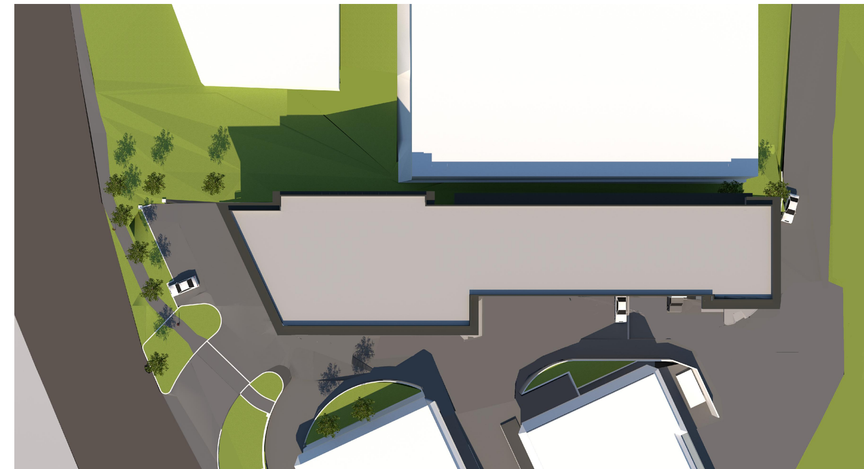
6 SEPTEMBER 21 @ 12pm