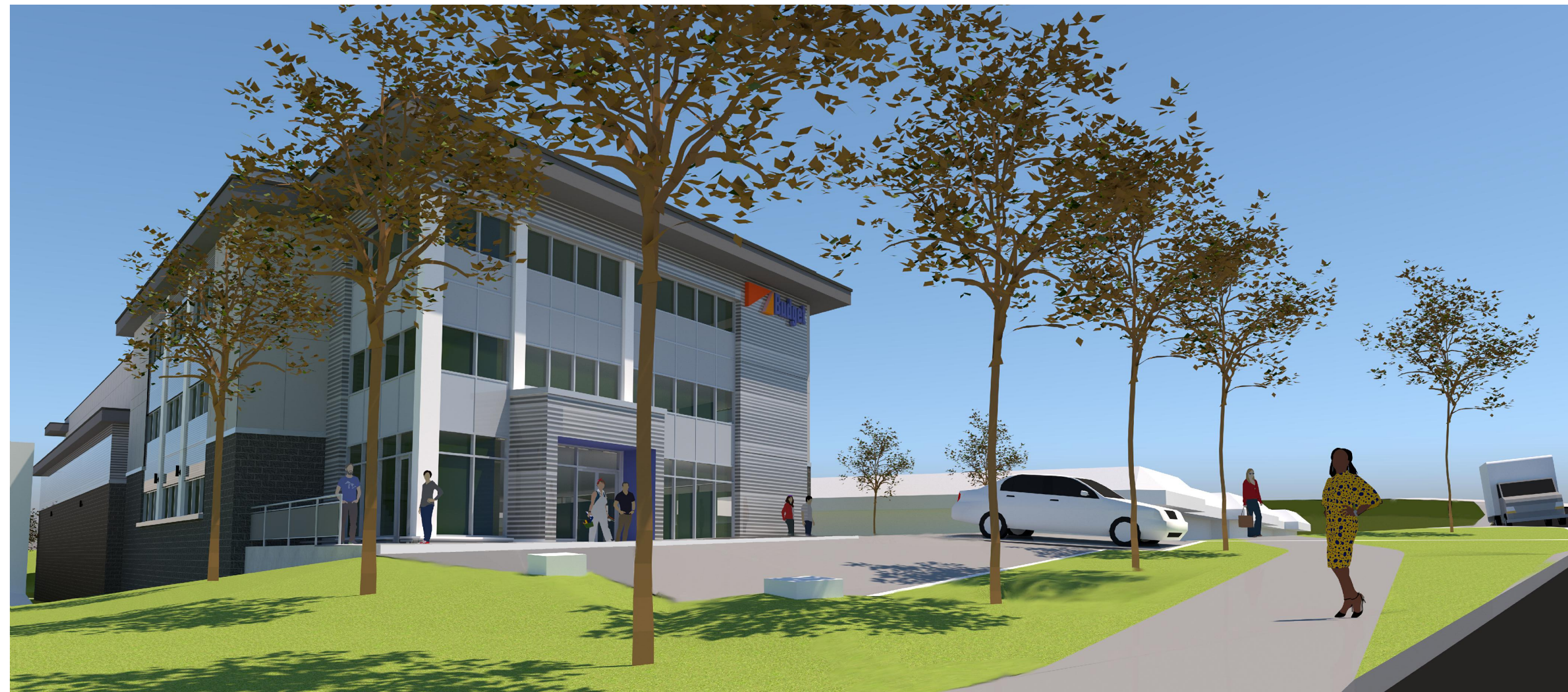
3 VIEW FROM NORTH-WEST