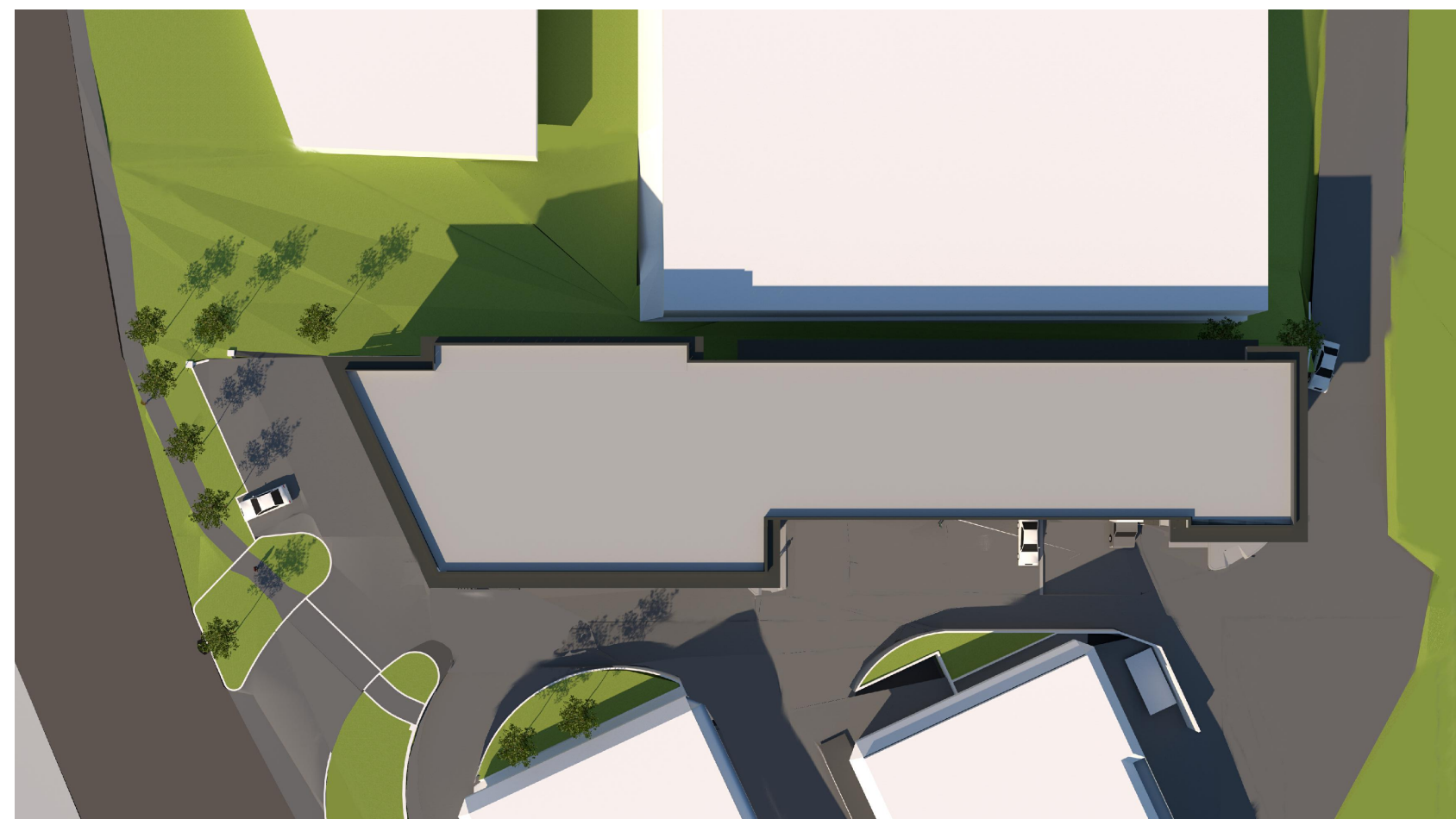
5 SEPTEMBER 21 @ 2pm