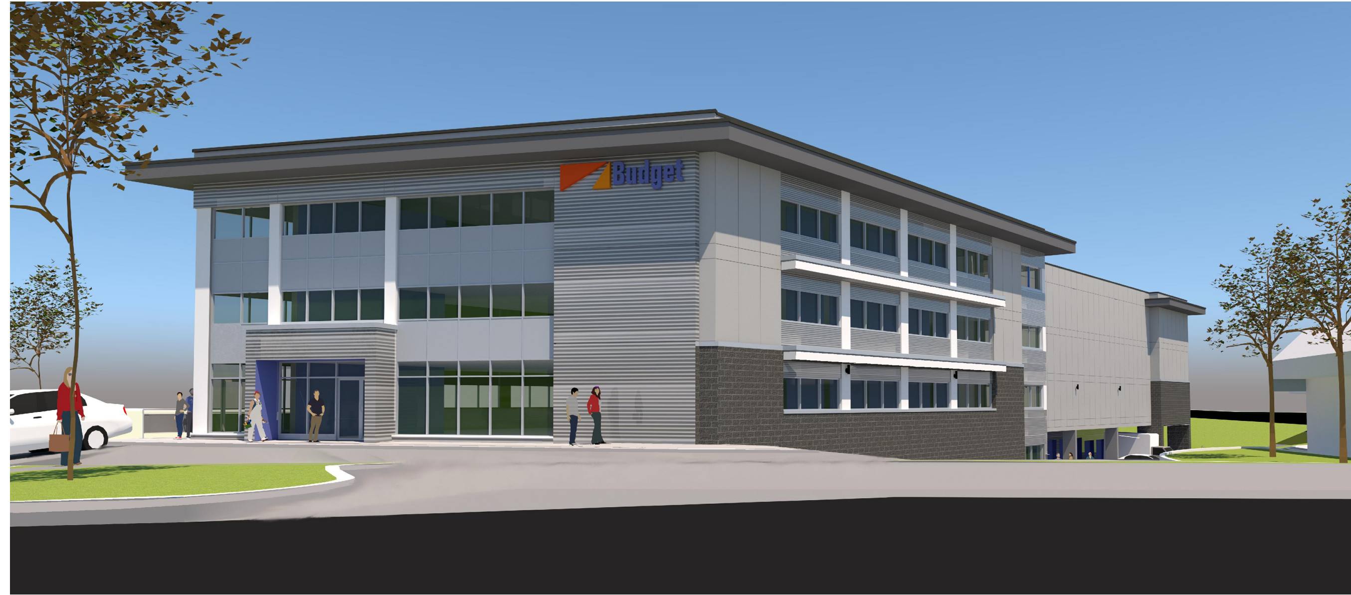
1 VIEW FROM SOUTH-WEST